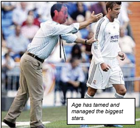
Age has tamed and managed the biggest stars.